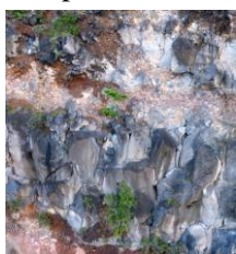
Figure 2: Detail of the outcrop at RN1 site, showing the roughness of the parent rock (basalt).

Figure 2 shows the roughness of the parent rock (basalt) at the RN1 site, translated by the expert by a variation of parameter S between 0 and 0.1 m. The variation of the maximum runout CDF compared to a simulation for which all the parameters vary simultaneously is estimated using the Kolmogorov smirnov statistic (denoted KS distance), which can vary between 0 and 1. The larger the KS distance, the larger the importance of the studied parameter on the simulation results (central insert of Figure 1). For all parameters, we study the variation of the maximum runout CDF using 5 different fixed values of the parameter and by calculating the corresponding KS distances. The distribution of the obtained KS distances is represented using boxplots in Figure 1 (lower part). For the RN1 site, we observe that parameters S and F0 of the parent rock play a dominant role on the simulation results when compared to other