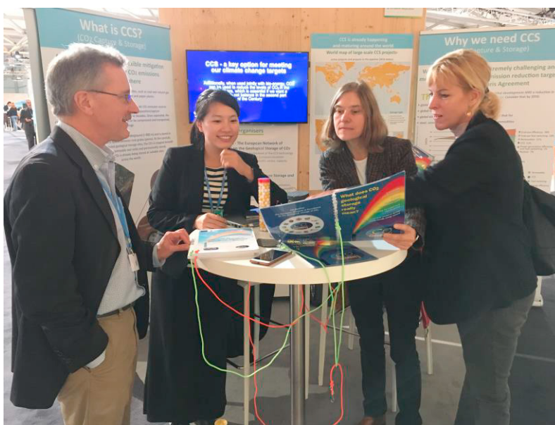
Fig. 2. Discussion at the CO 2 GeoNet/TCCSUA booth at COP23 in Bonn

Since 2013, CO 2 GeoNet has been an accredited observer organisation of UNFCCC, in the category “Research Institution NGO” (RINGO), and can therefore organise events at the Conference of the Parties (COP), both in the negotiation zone and in the public access zone. A major effort was made at COP21 in Paris in 2015, COP22 in Marrakech, and COP23 in Bonn in November 2017, in cooperation with other institutions. Participation at COP24 in Katowice (Poland) in December 2018 is currently being planned.